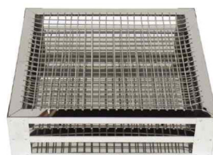
Spring wire rack