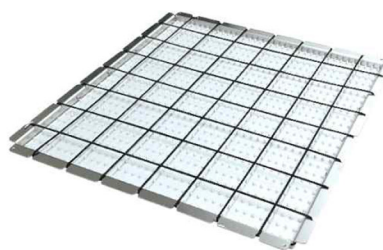
Rubber mat platform