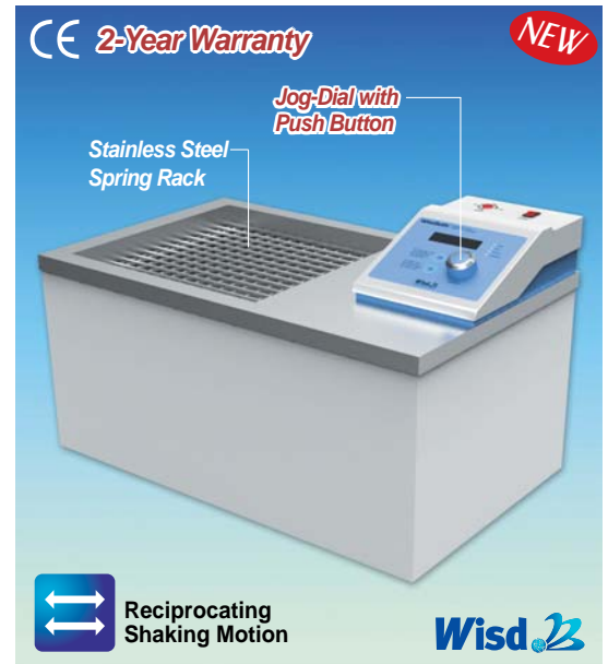
Digital Precise Shaking Water Bath "WSB-18" with Universal Spring Rack